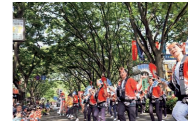
Sendai Aoba Festival

During the Sendai Tanabata Festival, which is held in August every year, we put up Tanabata decorations in front of the branch located in the arcade where the festival is held and Head Office Business Division. At the traditional Dontosai Festival that celebrates the Lunar New Year every January, approximately 50 employees made the traditional hadakamairi (naked shrine visit) to Osaki Hachiman Shrine wearing only light clothing in January 2019.